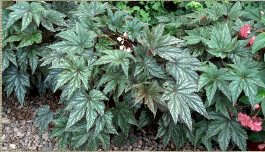
B. 'Gryphon' at a wholesale nursery