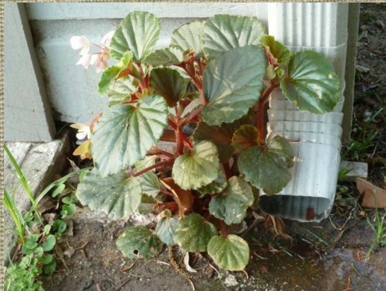
B. fisherii volunteer seedling at a downspout.